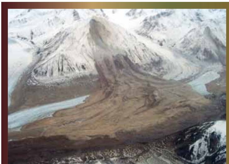
Figure 2. Landslide triggered by the 2002 Denali quake. http://pubs.usgs.gov/fs/2003/fs014-03/

plates rub together, some faults only become apparent when an earthquake occurs. The 7.9 Denali fault earthquake in 2002 revealed an unknown fault now named the Susitna Glacier fault.