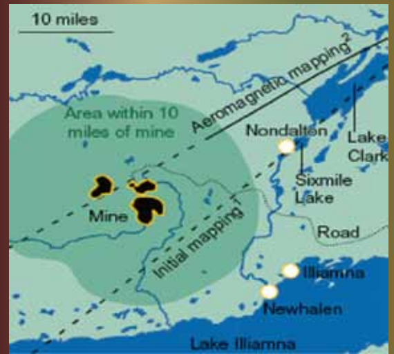
Figure 4. Geophysical locations of Lake Clark fault. Initial mapping of the Lake Clark fault estimates the fault to be within 10 miles. Aeromagnetic methods shows the fault a few miles to the north of the mine. In either case the fault is likely closer than 18 miles, the distance PLP assumes in its hazard calculations. Actual mapping of fault _____ Extrapolation of mapping - - - - -

Pebble depend on their proximity to the fault. The PLP assumes the fault is ~18 miles from Pebble, and structures are currently designed to withstand a 7.8 earthquake originating at this location. However, if the fault runs 5 miles from the mine, the force can be three times greater for the same earthquake. Risks associated with earthquakes include: