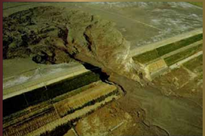
Aznalcóllar, Spain tailings dam rupture, April 25, 1998

agencies should require that the most conservative assumptions be used in mine designs. To date the earthquake analysis and predictions by PLP do not meet these criteria.